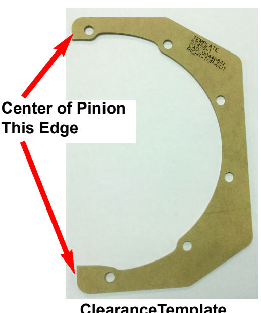
ClearanceTemplate p/n 57458-1